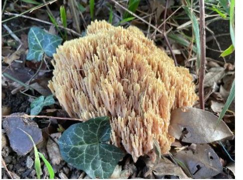
The fungus Ramaria stricta, "Straight-branched Coral"