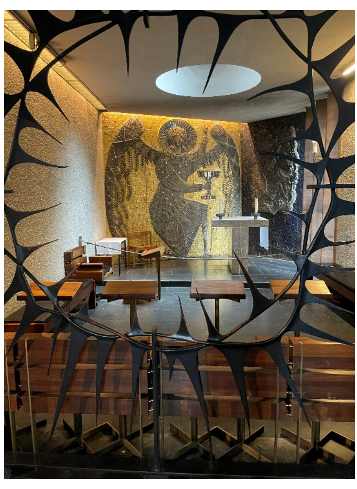
The Gethsemane Chapel, Coventry Cathedral

Pews News & Service Sheet for Sunday 13th November 2022