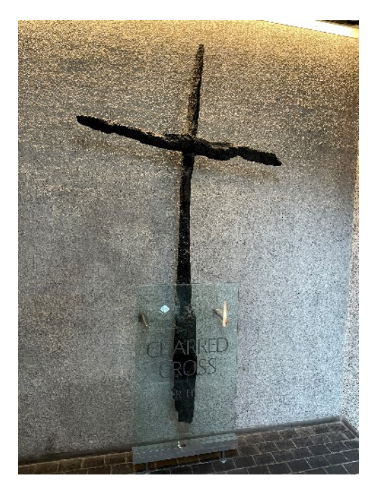
The Charred Cross, Coventry Cathedral