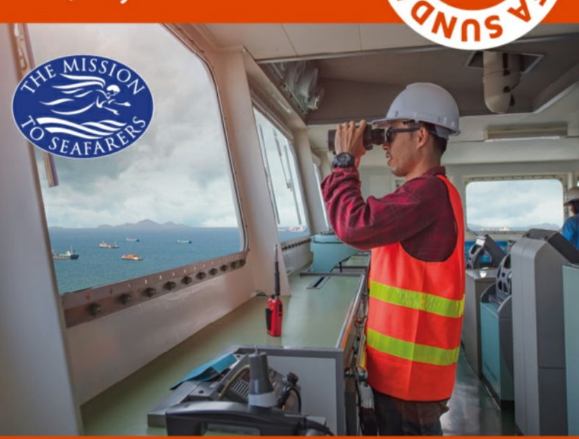
SEAFARERS NEED YOU MORE THAN EVER You rely on seafarers but they need your help also!

More than 90% of the world's goods and fuels are transported around the world, thanks to seafarers. Without them the world economy would grind to a halt. Day and night, 365 days a year, The Mission to Seafarers is on call providing help for seafarers in over 200 ports around the world in 50 countries. Mission to Seafarers provides help and support, regardless of nationality, gender or religion. Their network of chaplains, staff and volunteers can help with any problem – whether it's emotional, practical, or spiritual support that is needed.