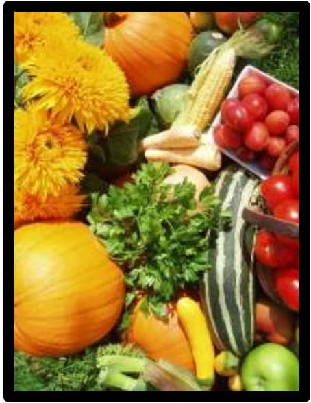
Blessed are you, Lord our God, King of the universe, creator of light and giver of life, to you be glory and praise for ever.