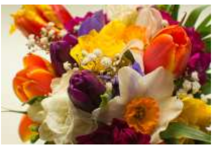
Flowers in church today: "In loving memory of Grandfather Don"