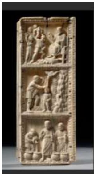
Unknown Byzantine artist [Rome or Milan] Relief panel with scenes from the life of Christ (Massacre of the Innocents; Baptism of Christ; Marriage at Cana), First third of 5th century CE, Ivory