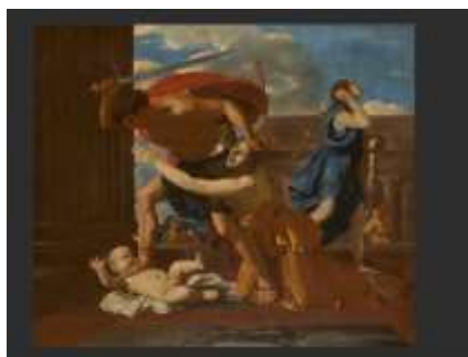
Nicolas Poussin The Massacre of the Innocents , c.1628–29, Oil on canvas