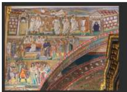
UNKNOWN ARTIST Massacre of the Innocents, mosaic on the triumphal arch of the nave, 5th century, Mosaic, Basilica of Santa Maria Maggiore, Rome